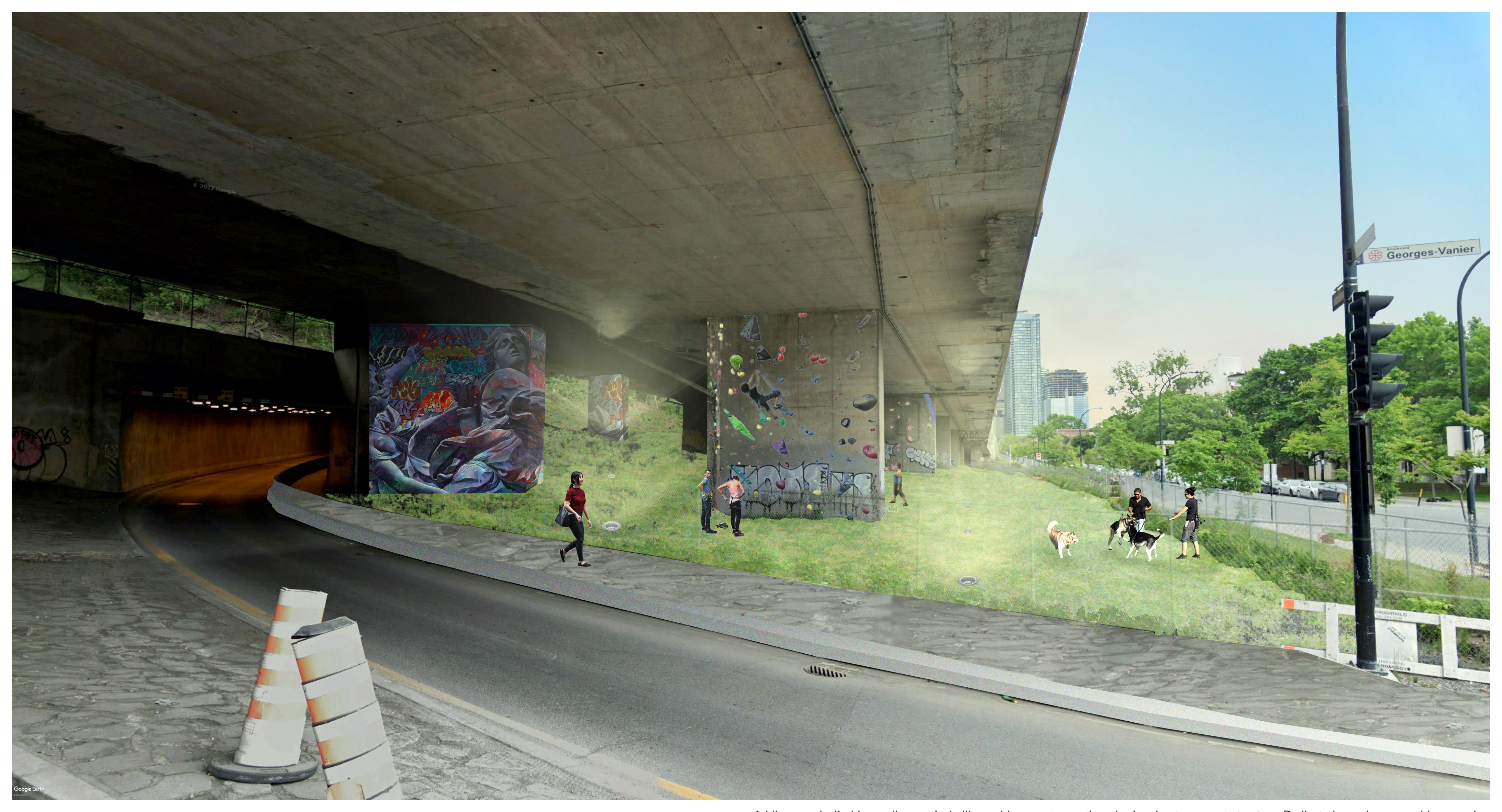
Adding a rock-climbing wall to vertical pillars adds a use to an otherwise inanimate support structure. Dedicated mural spaces add expression and character to a previously blank wall. Greenery brings colour, life and energy to the bleak, grey concrete landscape.