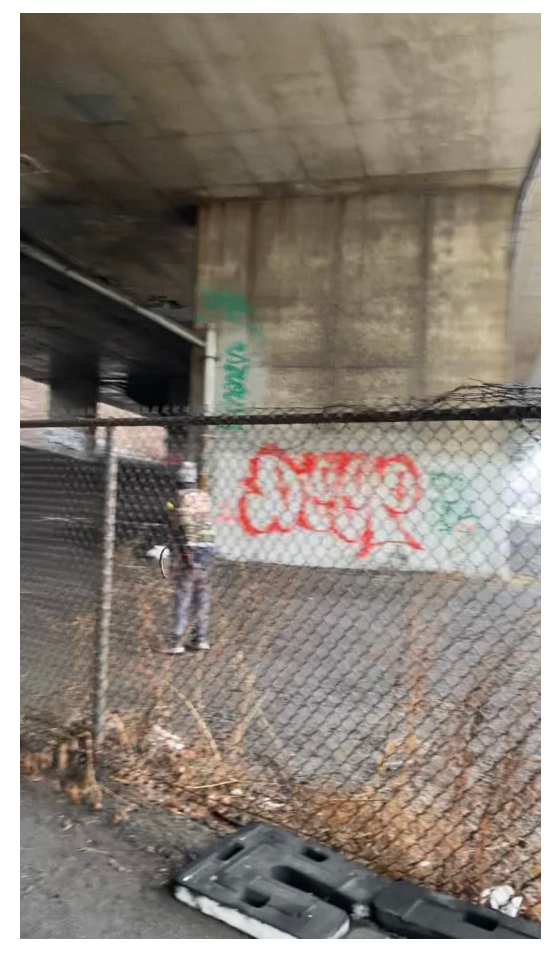
Photo taken across from Georges-Vanier station on December 31, 2022 at 2pm, showing a person playing tennis on one of the pillars holding the Ville-Marie Expressway.

Large portions of cities across America are divided by the highway systems put in place over the last century. By means of prioritizing the movement of motor vehicles, human activity was split in half.